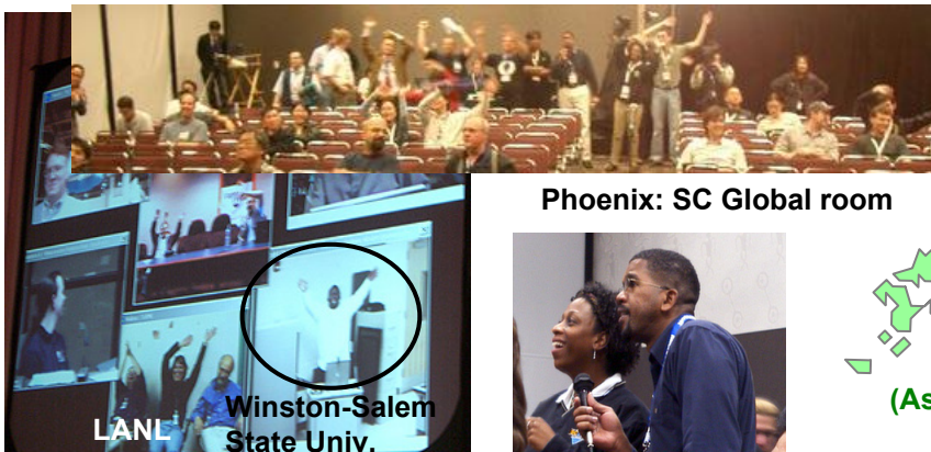
Phoenix: SC Global room