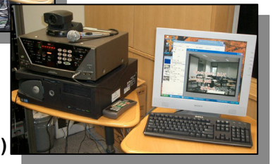
PIG-based Karaoke Grid node (PIG: Personal Interface to the Grid)