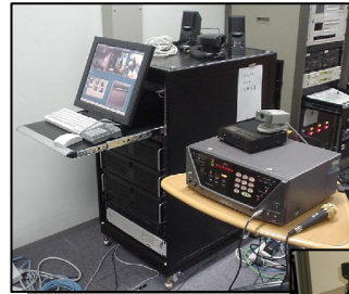
Karaoke-enabled Delivery Grid node (portable and full-featured Access Grid node)